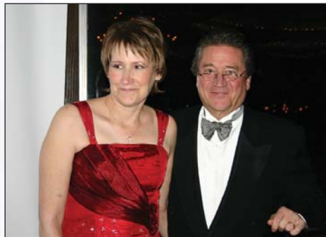
20 Years of Service Production Coordinator